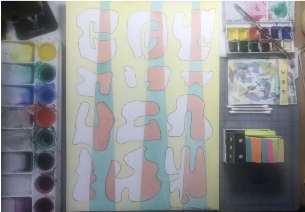
The paintings were based on drawings culled from my 70's sketchbooks, keeping tuned in with the era by bringing that decade up to 2020. The paintings would build upon the drawings from the 70's decade with strong women of today. They are now on view at Malin Gallery in New York City through June 19, 2021.